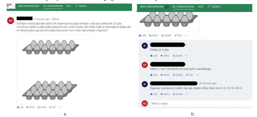
Figure 3 Example of Teacher 4 encouraging students to solve problems (Grade 5)

Translation [a. Teacher: From the box with fewer eggs, I took 3/4 of the total number of eggs. From the box with more eggs, I took 2/3 of the eggs. I transferred what was left to a third box. How big do you think that box is if I need one more egg to make it full? Have you seen a box like that in a store? b. Student: There are 5 eggs left. Teacher: Why 5? Explain your reasoning. Student: In fact, teacher, I think there are none left. Because 5+5=10, and 10-10=0.]