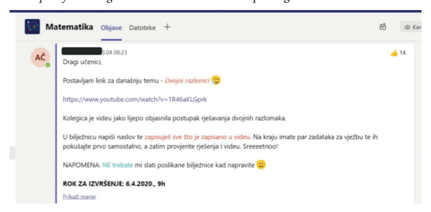
Figure 2 Example of teaching in the virtual classroom as posting materials

[Translation: I'm posting a link for today's topic - complex fractions. The video explains how to solve these fractions very nicely. Write the title in your notebook and copy everything written in the video. I've given you some exercises; try solving them by yourself, and then check the answers. Good luck. Note: You do NOT have to send photographs of your work. Deadline: April 6th, 2020, 9h]